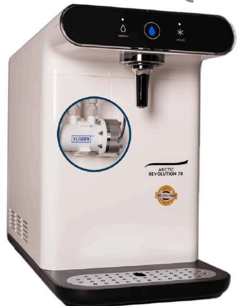
ArcticRevolution 70CL KLARAN