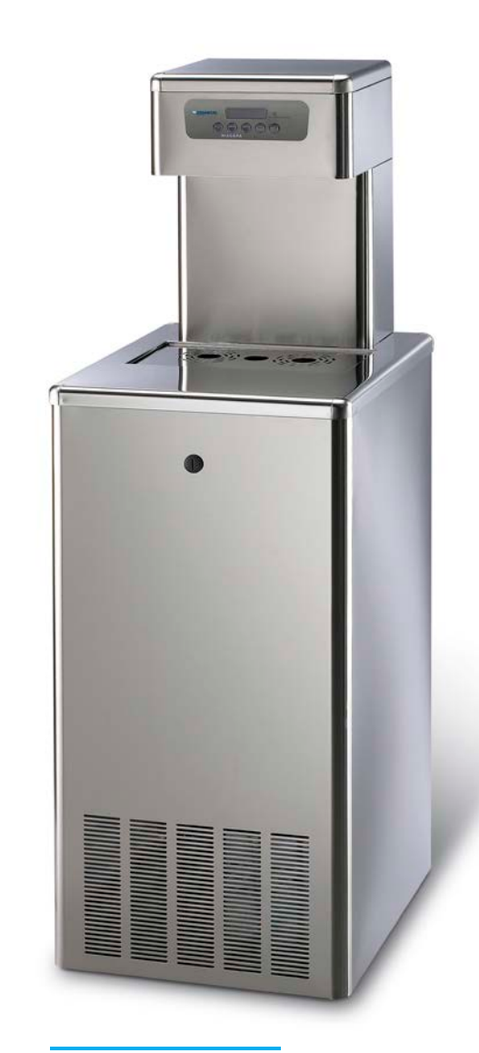
NIAGARA FS 120 (CEN120C8)

COSMETAL supply a vast range of products & product variations which we cannot show here. If you require other models not shown in our catalogue please contact us to discuss your requirements.