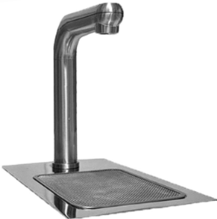
(Pictured with EZYTRAY 3)