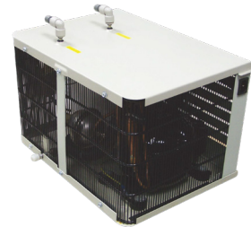
UC800M Undersink Chiller