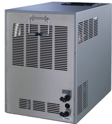
Niagara IN 120 WG Undersink Chiller